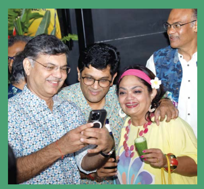
Issue 27 : Best Captions